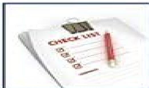
Figure out your workout schedule. If you were looking to change your lifestyle for the rest of ever, setting a workout schedule would