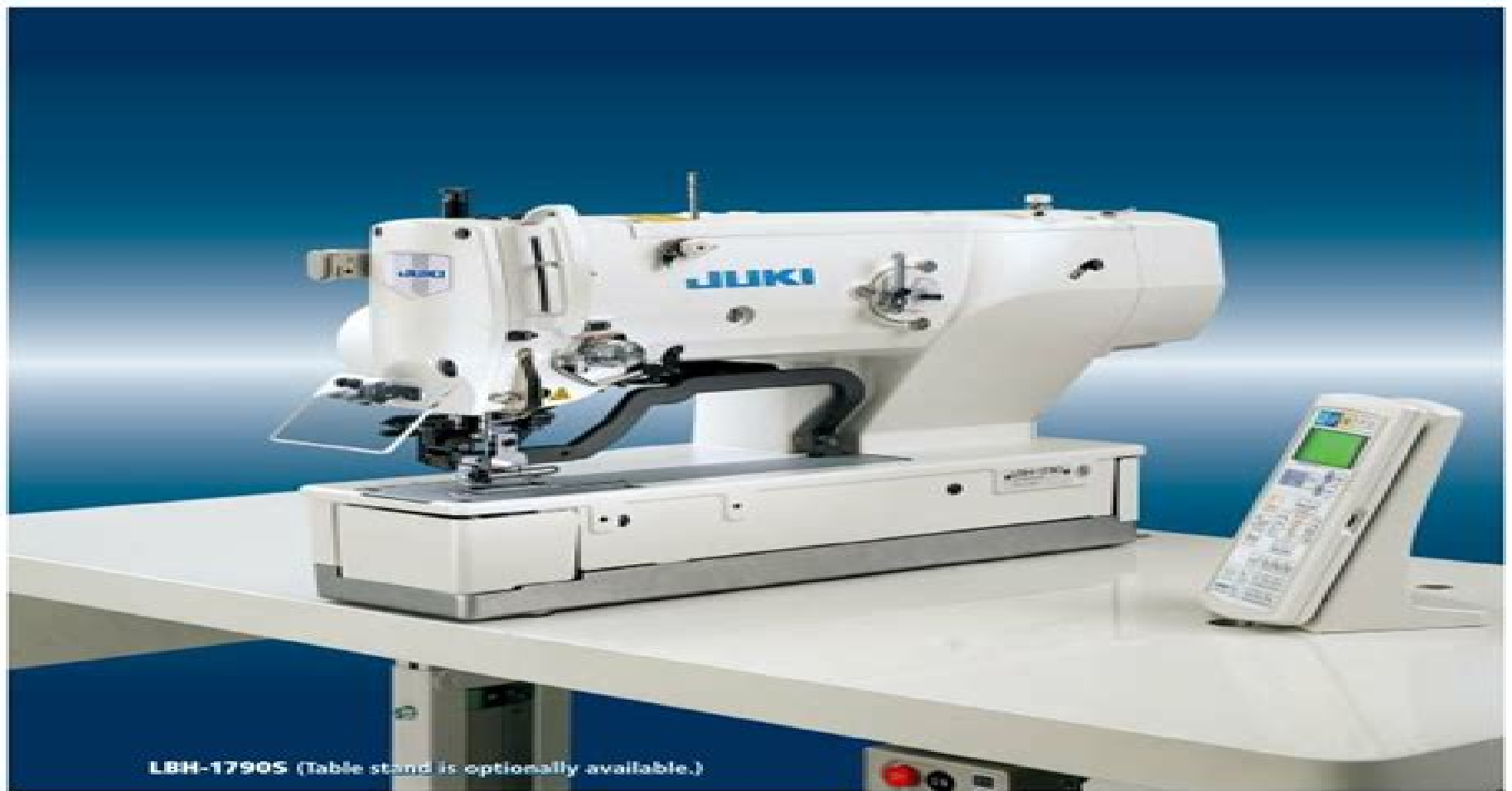
LBH-1790S (Table stand is optionally available.)

Computer-controlled, High-speed, Lockstitch Buttonholing Machine