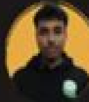
JRF 2ND RANK