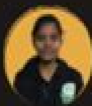
JRF 6TH RANK(CAT)