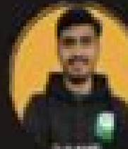
JRF 3RD RANK