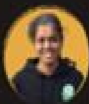
SRF 2ND RANK