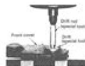
Removing the front oil seal