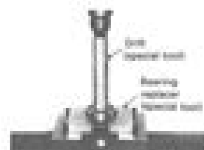
Separating the sprocket from the bearing

Special tool Bearing roller ST1123 0000 GSK ST1124 0001