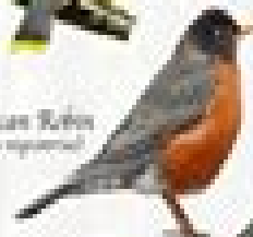
American Robin Merula migratoria