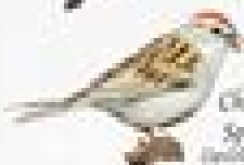
Chipping Sparrow Spizella socialis