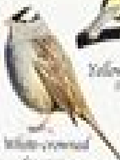
White-crowned Sparrow Zonotrichia leucophrys