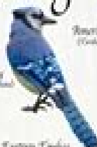
Blue Jay Cyanura cristata