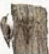
Brown Creeper Certhia americana