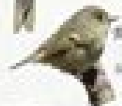
Ruby-crusted Kinglet Ceryle alcyon