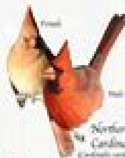
Northern Cardinal Cardinalis cardinalis