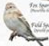
Field Sparrow Spizella pusilla