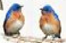
Eastern Bluebird Sialia sialis