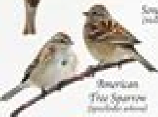
American Tree Sparrow Spizella arborea