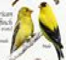
American Goldfinch Spinus tristis