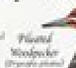
Pileated Woodpecker Geopelia pileata