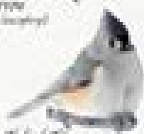
Tufted Titmouse Parus tilius