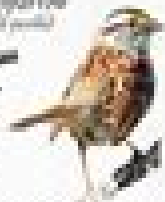
White-throated Sparrow Zonotrichia albicollis