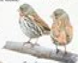
Fox Sparrow Passerella iliaca