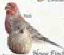
House Finch Monticola monticola