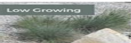
'Boulder Blue' Blue Fescue