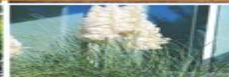
'Pumila' Dwarf Pampas Grass