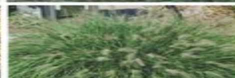
'Hameln' Fountain Grass