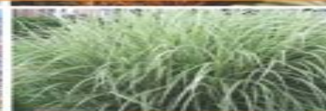
'Variegatus' Maiden Grass