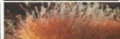
Flame Grass (Part-Shade)