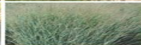
'Dallas Blues' Switch Grass