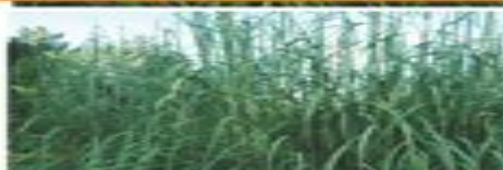
Ravenna Grass Giant Sacaton