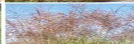
'Gracimillimus' Maiden Grass