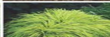
'All Gold' Japanese Forest Grass (Shade)