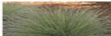
'Northern Lights' Tufted Hair Grass