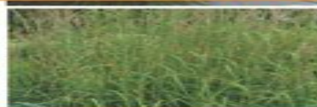
'Windwalker' Big Bluestem