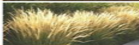
'Karl Foerster' Feather Reed Grass