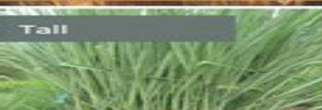
'Cloud Nine' Switch Grass