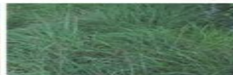
'Blue Zinger' Sedge (Shade)