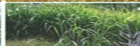
Giant Chinese Silver Grass