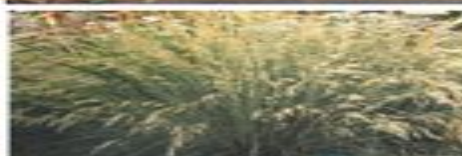
'Sapphire' Blue Oat Grass