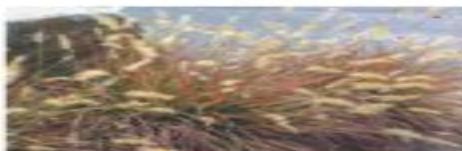
'Burgundy Bunny' Fountain Grass