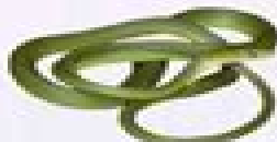
Northern Rough Green Snake