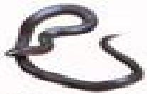
Midwestern Worm Snake