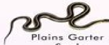
Plains Garter Snake