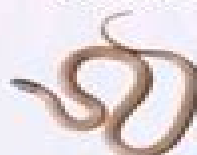
Southeastern Crowned Snake