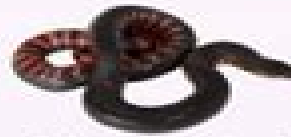
Western Mud Snake