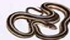
Eastern Garter Snake