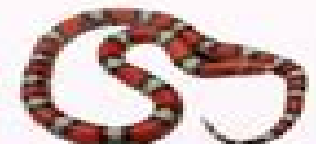
Northern Scarlet Snake