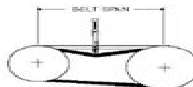
Part Number: "Tension Gauge"