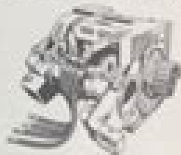
Traction Motor Fig. 1-4

101 Traction Motors Four Model D27 traction motors, Fig. 1-4, are used in each unit, mounted one on each axle. Each motor is geared to the axle, which it drives, by a motor pinion gear meshing with an axle gear. The ratio between the two gears, Fig. 1-5, is expressed as a double number such as 62/15. In this case the axle gear has 62 teeth while the pinion has 15 teeth.