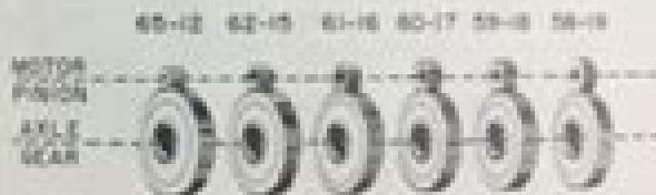
Gear Ratio Chart Fig. 1-5

During acceleration, the traction motor electrical hookup is changed to utilize the full power developed by the main generator, within the range of its current and voltage limits. The changes in the traction motor electrical connections is called transition. Four steps of transition are used on the GP9 as follows: