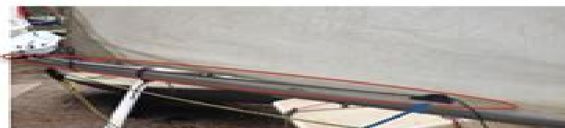
Clew outhaul back to cleat on boom