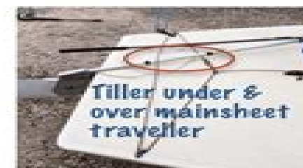
Tiller under & over mainsheet traveller