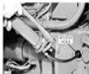
Clutch throw-out bearing cover hole

Every 100 hours, lubricate clutch throw-out bearing. To lubricate bearing, remove cover from access hole and place nozzle of grease gun on grease fitting. Lubricate with SAE multipurpose grease.