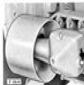
Belt pulley - like and then close

At the end of 100 hours of operation, the oil in the belt pulley should be checked. To check oil in belt pulley, remove plug on side of pulley housing and fill with SAE 10 multipurpose lubricant to level of filler hole.