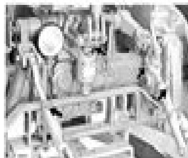
Universal L-Power Bleed grease fitting

At the end of 100 hours of operation, lubricate the fitting on the rear of the load control valve. Also lubricate the three fittings on the right and left lift lines. Use two shots of SAE multipurpose grease at each of these fittings.