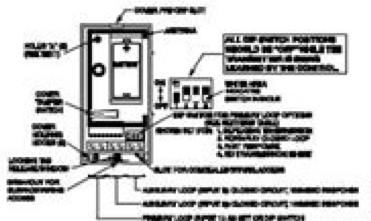
Keywords: child sexual abuse, child sexual exploitation, child sexual abuse, child sexual exploitation, child sexual abuse, child sexual exploitation