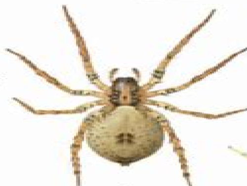
5. Buzzing Spider Anyphaena accentuata ♀ 6 mm