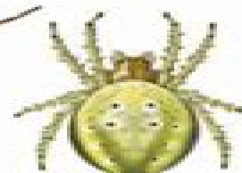
10. Orbweb Spider Araniella cucurbitina ♀ 6 mm