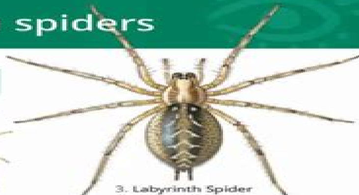
3. Labyrinth Spider Agelena labyrinthica ♀ 12 mm