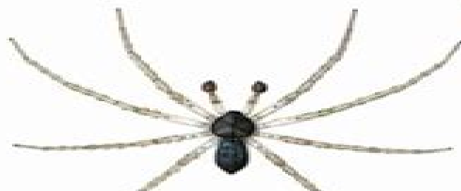
4. Running Crab Spider Philodromus dispar 5 mm