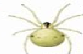
2. Comb-footed Spider Pardiscura pallens 1.5–2 mm