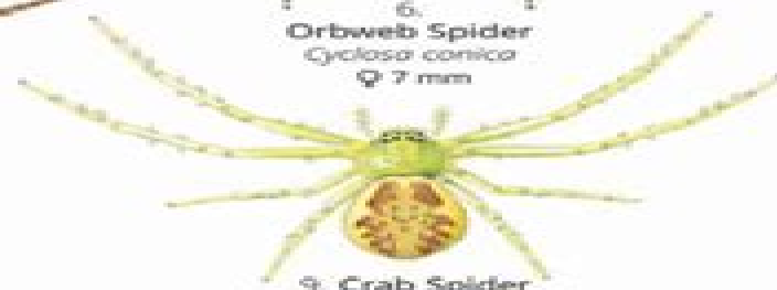
9. Crab Spider Diaea dorsata 6 mm