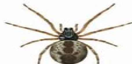
7. Meshweb Spider Dictyna arundinacea ♀ 3 mm