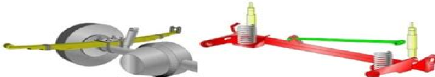
Left: Solid axle rear suspension with leaf springs. Right: Solid axle "trailing arm" rear suspension for a front-wheel-drive model. Note the track bar directly above the axle.