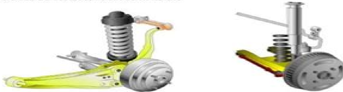
Left: Multi-link rear suspension. This design has two lower control arms. Right: Modified MacPherson strut rear suspension. Note the tie rod end bolted to the control arm, used to adjust rear toe.

There are numerous rear suspension designs, many of which are variations on the SLA, MacPherson strut, multi-link, or modified strut designs. On light trucks, a solid axle with leaf springs is common. Some front-wheel-drive rear suspensions use a track bar or track rod to prevent lateral or side-to-side movement of the rear axle.