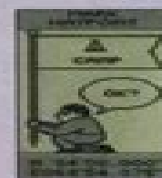
Mark waypoint page