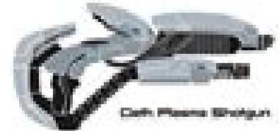
Cath Plasma Shotgun