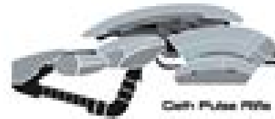
Cath Pulse Rifle