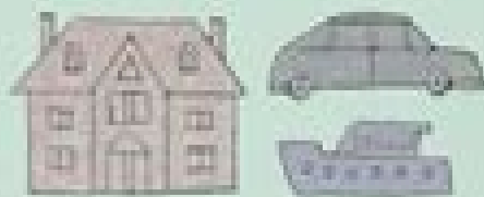
Manage and sell assets