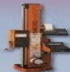
1985 TESA MICRO-HITE version 04