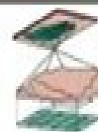
Orthophoto Feature Collection