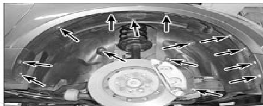
22.2b ... then remove the remaining fasteners and remove the splash shield