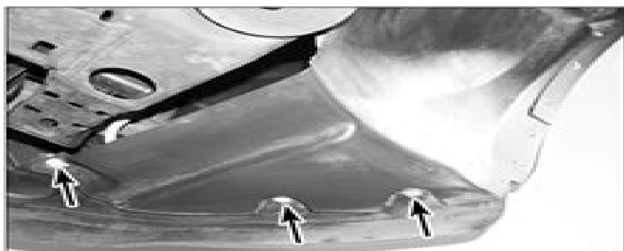
22.2a Remove the fasteners from the front area of the inner fender liner...