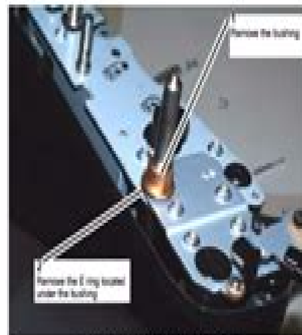
Figure 8 Removing the bushing and O-ring