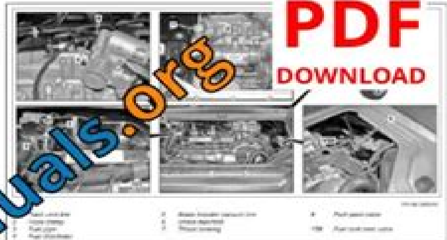
Fig 1: Identifying Rear-Wheel Drive Module Components (1 Of 2)

Year 1990 1991 1992 1993 1990 1990 1991 1992 1993