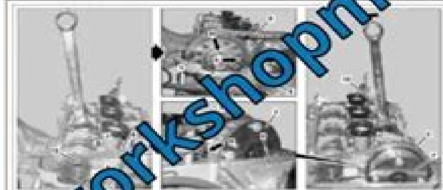
Fig. 3. Adjusting Camshaft