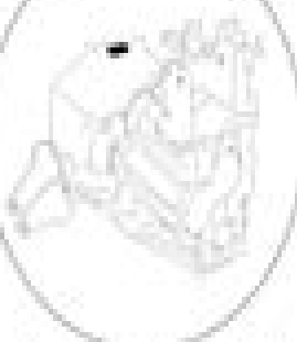
Manual transaxle number