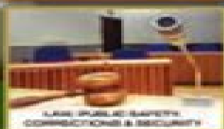
LAW, PUBLIC SAFETY, CORRECTIONS & SECURITY