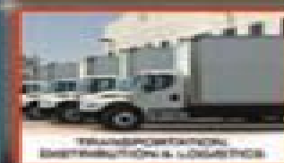
TRANSPORTATION, DISTRIBUTION & LOGISTICS