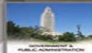
GOVERNMENT & PUBLIC ADMINISTRATION