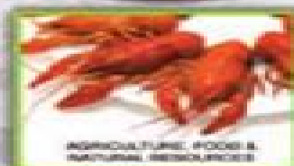
AGRICULTURE, FOOD & NATURAL RESOURCES