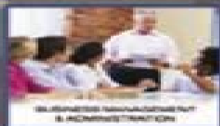
BUSINESS MANAGEMENT & ADMINISTRATION