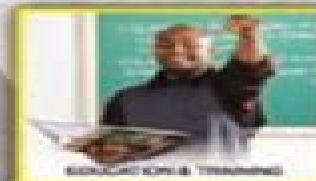
EDUCATION & TRAINING