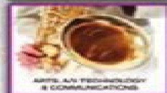
ARTS, A/V TECHNOLOGY & COMMUNICATIONS