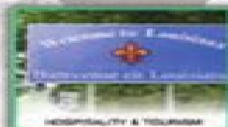
HOSPITALITY & TOURISM