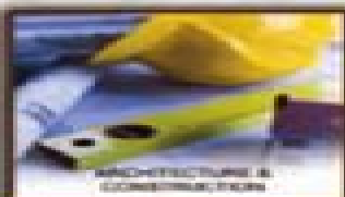
ARCHITECTURE & CONSTRUCTION