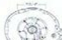
Chrysler TH-727 & 904, 373, 374, 340, 340