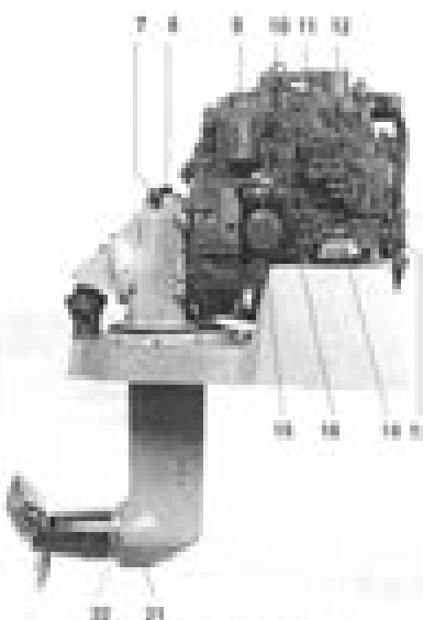
MD2020A & MD2