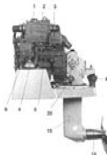
MD2010A & MD2