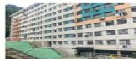
c Low -income residential area