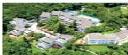
a High -income residential area