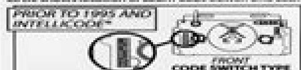
FIG. 1. POWERHEADS (for various models) Circle shows location of Learn Code Button and LED.