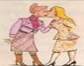
a kiss on the cheek