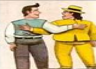
a pat on the back