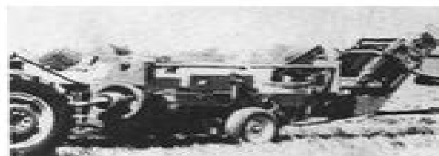
MF 12 BALER