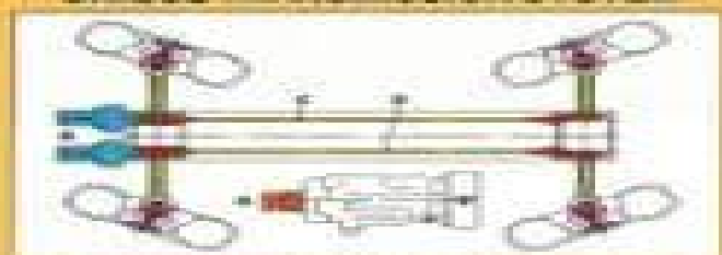
INTERIORAL HYDRAULIC LAYOUT (VIEW AT THE REAR)

This unique MERLO transmission layout uses two variable hydraulic piston motors, connected in parallel to a single variable displacement hydraulic pump.