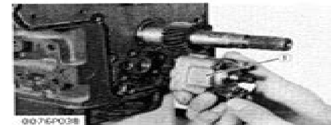
(1) Oil Pump Assembly