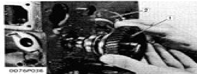
(1) Fuel Camshaft Assembly