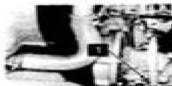
C-175 Gasoline Engine

Stamped on the right side back of alternator-generator.