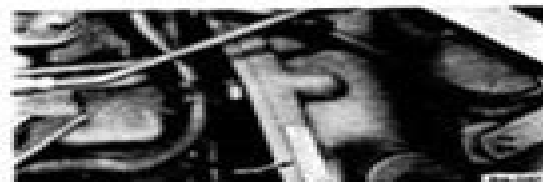
Skidded Unit No.

Stamped on the name plate located on the left side of the Clutch housing.