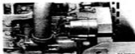
C-157 Gasoline Engine

Stamped on the right side of the crankcase.