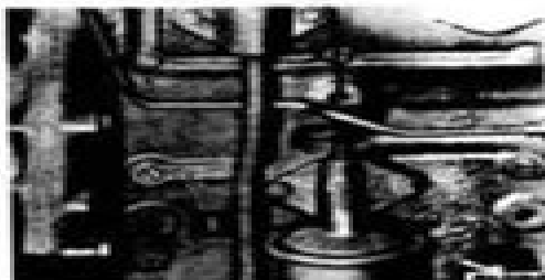
D-179 Diesel Engine

Customers are urged to supply the tractor (or Chassis) and engine serial numbers, including model prefix when ordering parts.