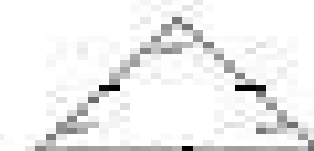
Equilateral triangle Equilateral triangle

A regular polygon is a polygon in which all sides are congruent and all angles are congruent.