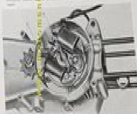
Fig. 1. Major world centers for export of 2000 metric tons and more of cotton.

THE UNIVERSITY OF CHICAGO Library of The University of Chicago 540 East 58th Street Chicago, IL 60637 Tel: 773/936-3333 Fax: 773/936-3333 Email: library@chicago.edu Website: www.library.uchicago.edu