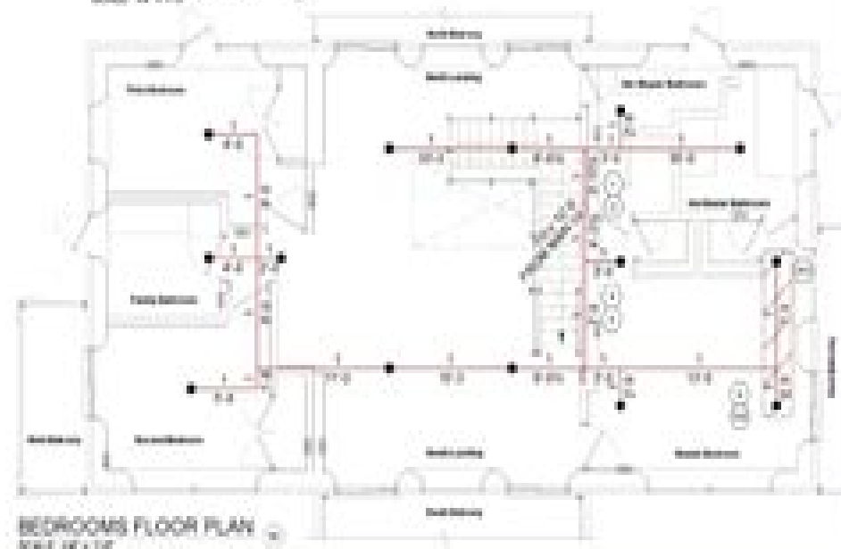
REWORKED FLOOR PLAN 2001.08.10