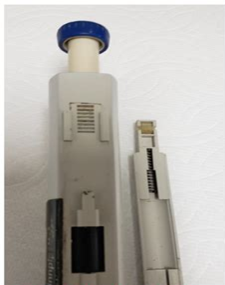
Pipette Body w/ Tip Ejector Pusher Mechanism Removed