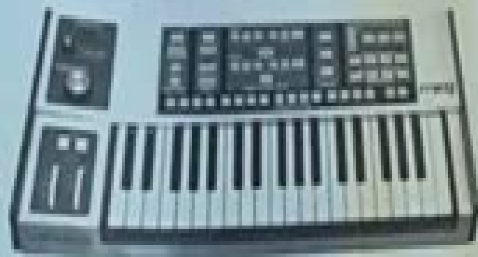
EXHIBITS MODEL 1070 SUPPORT MODEL 1080