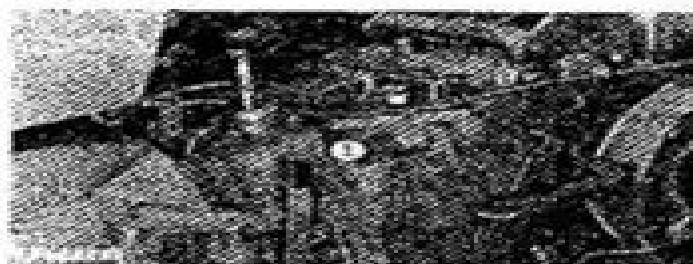
Fig. 4 Left-hand Separation Procedures

Disconnect the clutch return spring. Remove the left-hand and right-hand footrests. Remove the transmission shield.