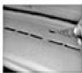
11.49 Lift off the two covers

both covers from the face on both sides (see illustration).