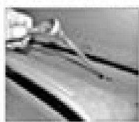
11.50 Then remove the four upper retaining bolts

43 Under the four outer mounting bolts from the face on both sides (see illustration).