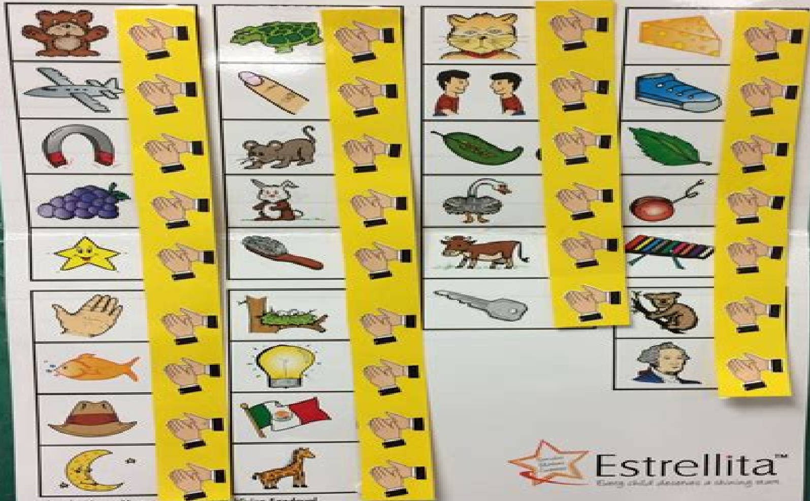
Chart by Karen Myer • Copyright © 1997, 2000 Illustrations by Wilen Sandoval