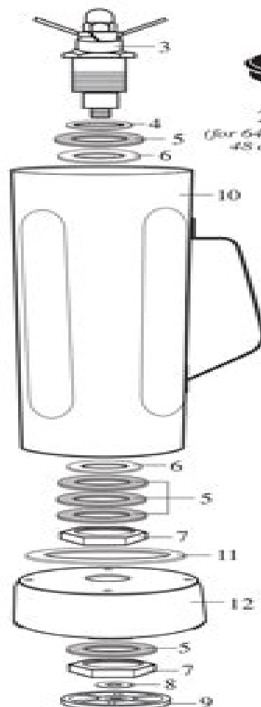
503119 500625 (older units) Blending Assy.