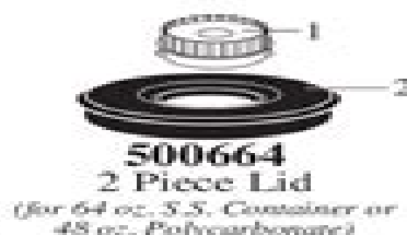
500664 2 Piece Lid (for 64 oz. S.S. Container or 48 oz. Polycarbonate)