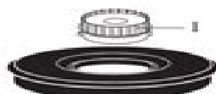
027142 2 Piece Lid (for 64 oz. Lexan Container)