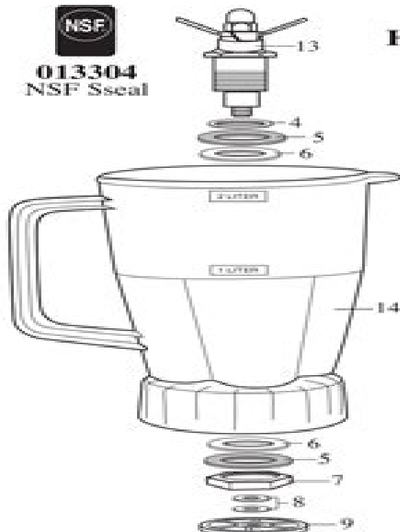
503120 - Blending Assy. Kit 502370 - Blending Assy. (older units)