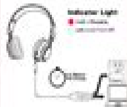
Indicator Light Red: Charging Green: Full