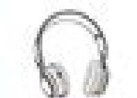
What's Included KidSafe Bluetooth Headphones