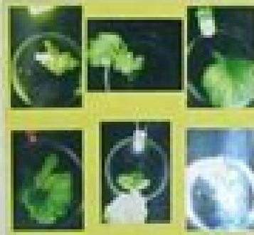
Student Managerial and Learning Student Inquiry