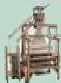
Jacquard Loom (1804)