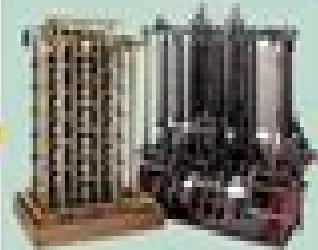
Analytical Engine (1833)