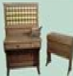
Census Machine (1889)