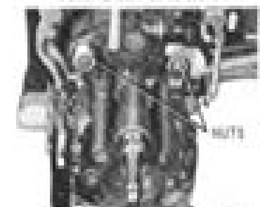
Figure 3-3. Carburetor Attaching Nuts