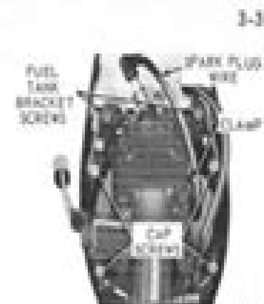
Figure 3-1. Fuel Tank Screws and Fuel Line