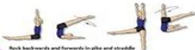
Back backwards and forwards in pike and straddle