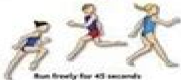
Run freely for 40 seconds