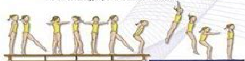
Walk forwards along a bench and full turn in the middle