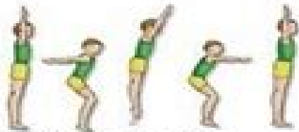
Stand and jump to safe landing