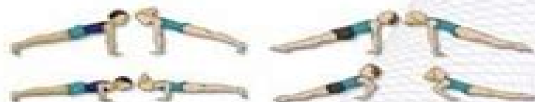
Front and back support, lower to the floor with control