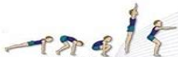
From front support, jump in and up