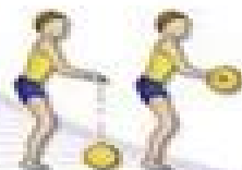
Bounce and catch a ball 3 times