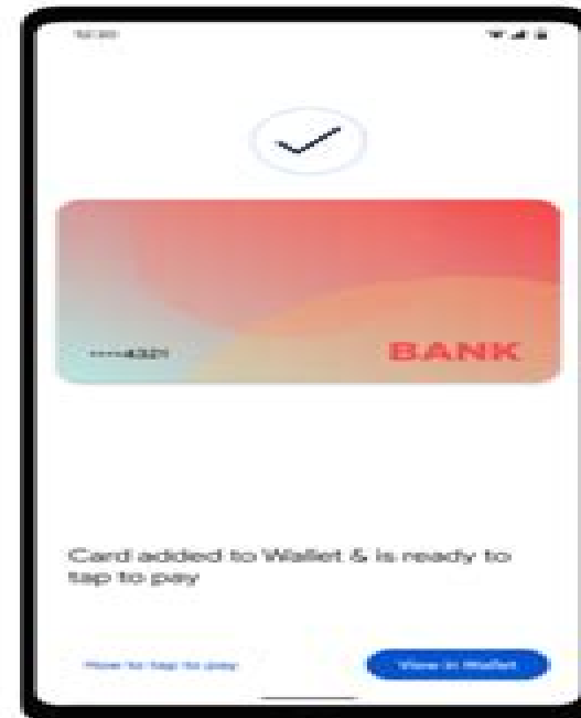
6. Success screen