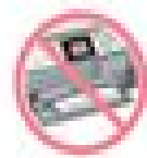
Do not do this