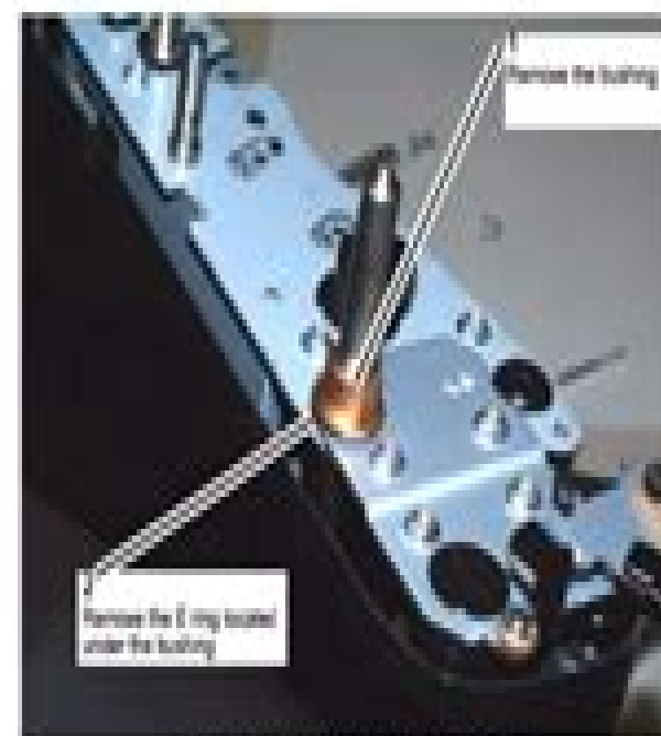
Figure 8 Removing the bushing and O-ring